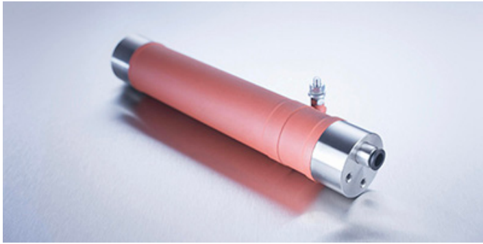
Figure 1: High-voltage power supplies rely on highly robust components such as this high-voltage resistor.