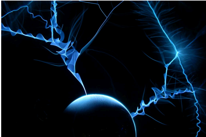
Figure 2: Large differences in electrical potential can suddenly discharge through ionized gas in the atmosphere or through paths to ground in circuits, resulting in electric arcs in nature and in high-voltage applications.

the nature of the most suitable suppression method can vary significantly. If the arc-suppression response is too rapid, for example, additional arc events can occur in some cases. Consequently, high-voltage supplies might employ a variety of suppression profiles and automatically tailor the response as needed.