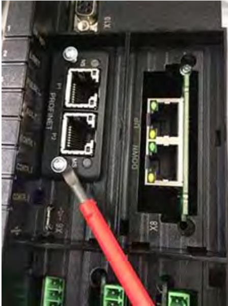
Figure 6. Anybus module removal

If an Anybus module must be removed from the unit, loosen the TORX T8 mounting screws 3 turns, and pry out the module with a small flat-bladed screwdriver, as shown in the following figure.