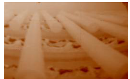
Infrared image of inside furnace