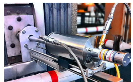
FurnaceSpection system setup