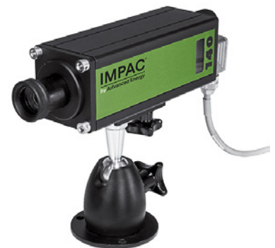
Advanced Energy's Impac 140 Series