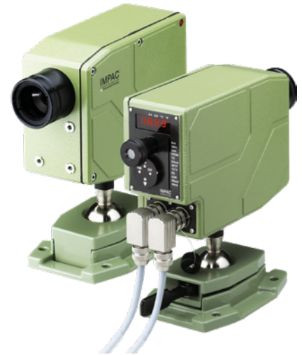
Advanced Energy's Impac IS 12-AI pyrometer

To monitor the strand temperature, an IGA 140/23 or IPE 140 in combination with an emissivity enhancer is used. Measuring temperatures from 5 and 50°C upwards, these pyrometers are the perfect units for the quenching process.