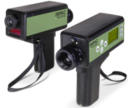
Advanced Energy's Impact IGA 8 plus