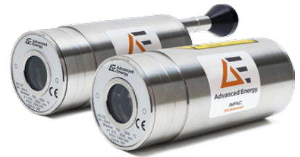
Advanced Energy's Impact IGA 6