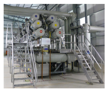
High-voltage SF<sub>6</sub> Gas-Insulated-Switchgears (GIS) are solutions more and more privileged by T&D operators in need for compact and enclosed substations.