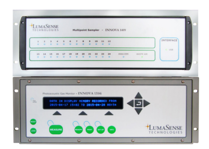
SF, Leak Detection System - 3731