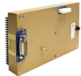
Fig. 1. UltraVolt® High Power C series 2C24-P250

This power supply met the customer's technical requirements, including suitability for high-energy pulsers, amplifiers, and discharge devices with large capacitance, fast repetition rates, and high current loads. The customer was extremely satisfied with the performance but requested a control connector that can