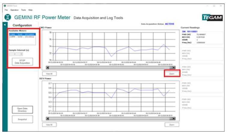
Figure 2: GEMINI Tools power meter application main window

Download the application at <u>www.tegam.com/geminitools</u>. To install, launch the GEMINITools.msi file and follow the onscreen prompts.