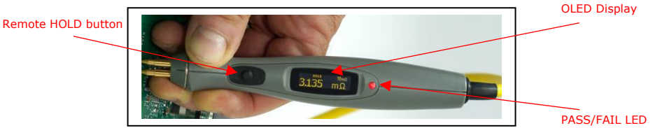
Figure 1: BKDP-M2 Display Probe

An optional accessory for the 710A, the Display Probe features an integrated OLED display, a remote HOLD button, and a PASS/FAIL LED. The Display Probe controls are shown in Figure 1 below.