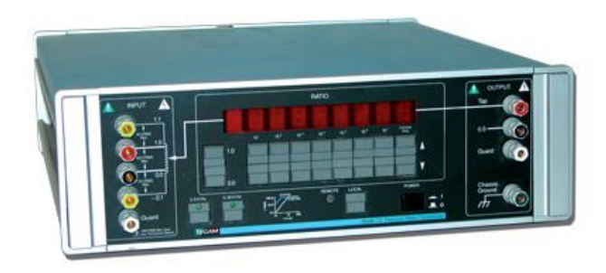
Figure 3 – TEGAM's Model PRT-73 Precision Ratio Transformer tests synchro resolvers at better than 1 arc-second (0.00028 degrees) accuracy.

In Figure 1, a TEGAM Model PRT-73 is used. The PRT-73 can be controlled remotely via an IEEE-488 bus, which means this process can be automated, provided the other instruments required for the test can also be controlled remotely. The resolution of the PRT-73 is 0.1 ppm, which translates to an angular resolution of 0.0000057° or 0.02". The accuracy of the PRT-73 is dependent on the frequency of the reference and its setting. The worse case linearity specification at 50 to 1000 Hz for the PRT-73 is 0.9 ppm, which is better than 0.2" angular accuracy.