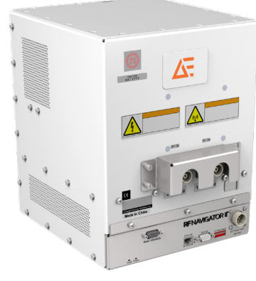
Advanced Energy's Navigator® II RF Matching Network

Once reliable and stable power delivery for plasma processes is established, etching tall stacks with higher accuracy and fewer defects becomes standard.