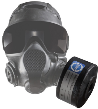
Air purification devices, such as respiratory mask filters, have to be tested according to standard tests, in particular to check their compliance for breakthrough time.

Using precise multi-gas monitors is crucial for breakthrough testing of air purification devices to ensure that specific quality standards are being met.