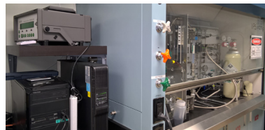
The Innova 1512 Photoacoustic Gas Monitor is conveniently located next to the test bench (inside the fume hood) and provides online measurement from direct sampling ports.

The above table gives an example list of challenge gases, with challenge concentration and breakthrough detection levels. The values for cyclohexane, sulfur dioxide, and ammonia correspond to the NIOSH Statement of Standard for Chemical, Biological, Radiological, and Nuclear (CRBN) Full Face-piece Air Purifying Respirator (APR).