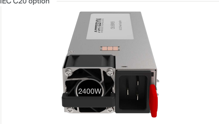
IEC C20 option